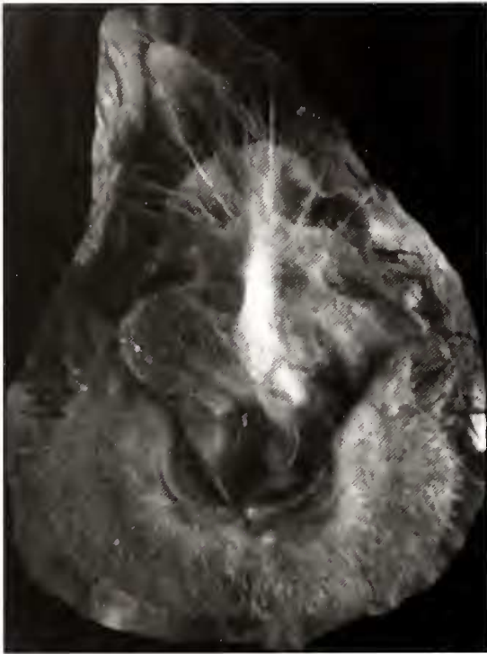
Fig. 4. Noseleaf of the holotype (FMNH 195182) of Rhinolophus willardi sp. nov..

dian angulation. The infraorbital bridge is short and stout. All of the eastern taxa are smaller in size. These shared similarities suggest that the eastern and western taxa represent two distinct clades within the R. maclaudi group.